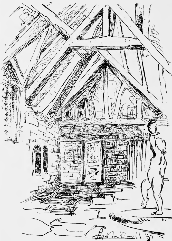
View in Our Exhibition Hall

We ho'd a Flower Show each year at "Pecny and Iris Time." Yourself and flower-loving friends are invited to see the finest planting of peonies in the state, if not in the world.